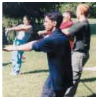
The Academy focuses on the concepts, skills, and values leaders need to be effective in their roles as business leaders. The program focuses primarily on the individual rather than the organization. Interactive large group sessions are complemented by small group discussions led by Alpha Kappa Psi alumni and successful business leaders.