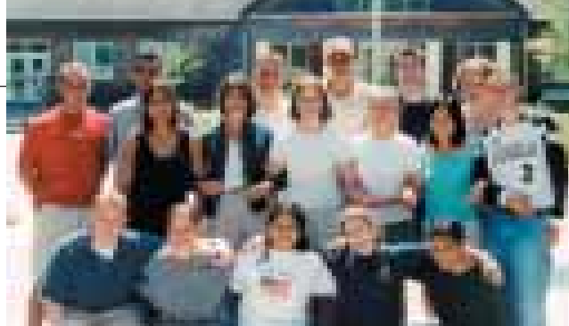
Seventeen students participated in the three-day Academy. All expenses—including transportation, meals, lodging, and materials—were provided by the Foundation.

THIS FIRST-RATE , all expenses paid leadership development conference was held June 23-26, in Morgantown, Indiana. It is among the finest learning opportunities offered to the membership of Alpha Kappa Psi—or that of any fraternity. Completely funded by the Alpha Kappa Psi Foundation, the four-